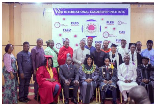
Group Photo of the inductees' present