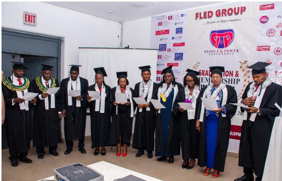
December 2021 Set of Inductees taking their Oath of Honour