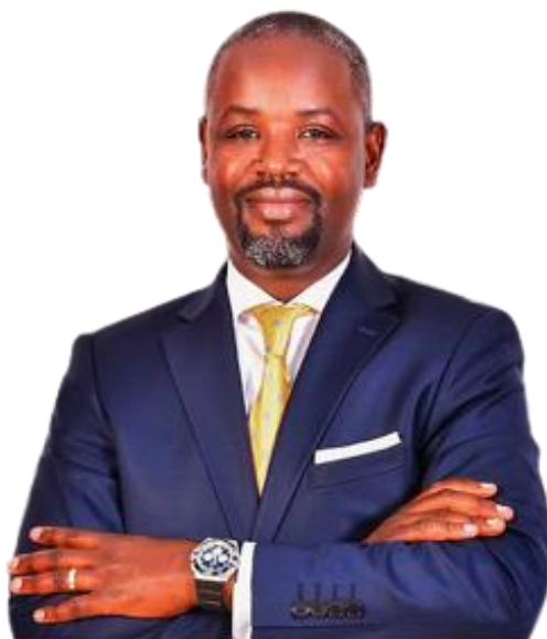
Rt. Hon. Thomas Tayebwa, Hfi, Deputy Speaker, Ugandan Parliament

Tayebwa is an entrepreneur with interests in communications and media, culture and heritage,